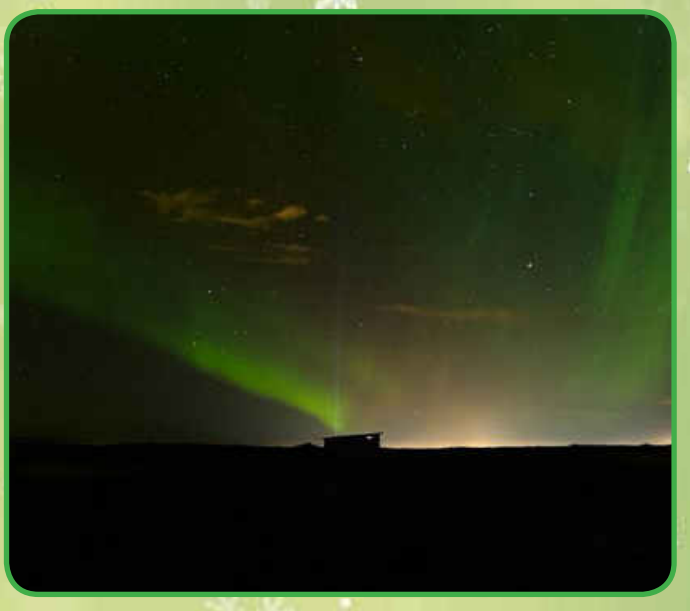
The beautiful Northern Lights...