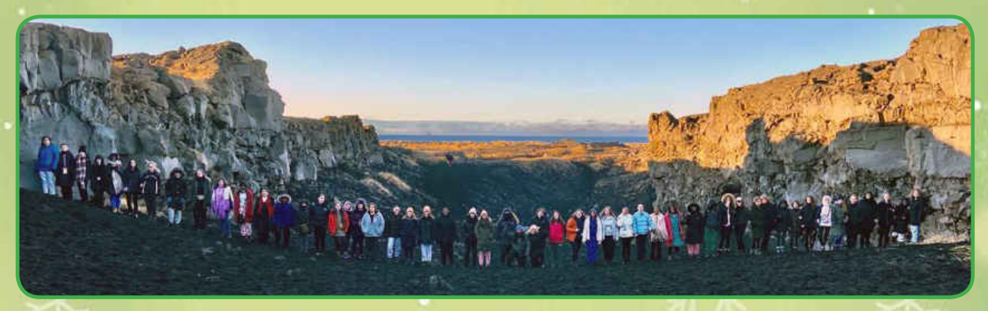
Students form a chain across the plate boundary between the Eurasia and North American plate which divides Iceland.

The highlight of the day here was an exploration through a lava tubing cave where we marvelled at the changing colours of the lava rock formations while walking in the path of lava that flowed during an eruption.